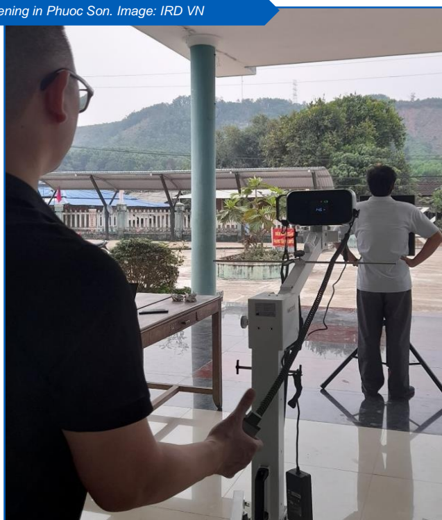
X-ray screening in Phuoc Son.

First, the project piloted the new tools in a mountainous district, Phuoc Son, near the Vietnamese border with the Lao People's Democratic Republic. Following the success of this eight-day campaign, screening began in Cu Lao Cham, a small island 8 miles off the coast of Hoi An in central Viet Nam. The island is home to around 2,000 people who can struggle to access essential health care services located on the mainland. In 2019 and 2020, an X-ray truck was transported to the island by ferry for screening campaigns, but on this occasion, rough seas made this too risky to repeat.